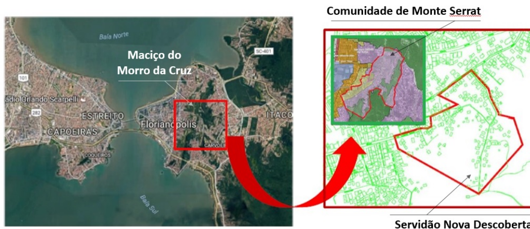
Fig. 1 Left: Maciço do Morro da Cruz view (red square), in Florianopolis, SC; Right: Monte Serrat community (green square) and Nova Descoberta Street (red polygon).

The study site selected for this research was a street called Nova Descoberta within Monte Serrat Community, one of the 18 tenements in MMC (Fig. 1). Nova Descoberta Street is in an environmentally vulnerable area, designated as a Limited Use Preservation Area (or APL in Portuguese acronym) by the Brazilian Forest Code.