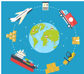
LOGISTICS (highways, railways, ports and airports)