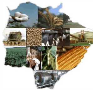
Economy and Production