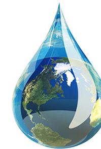
WATER RESOURCES (water supply and exploration of hydrographic basins)