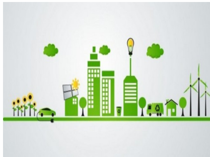
ENERGY (electricity, mining, oil and gas)