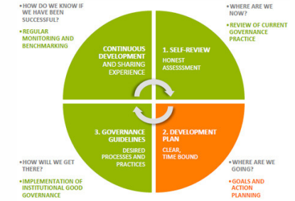
Planning and Governance