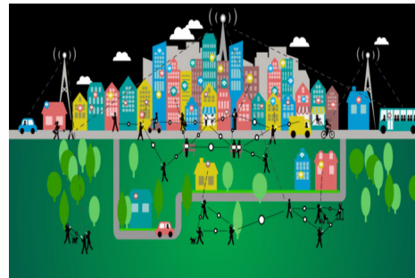
URBAN DEVELOPMENT (housing, urban mobility and sanitation)